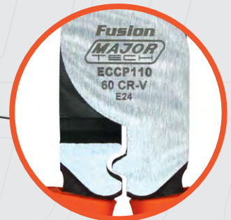
60CRV Chrome Vanadium Steel