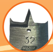
3-point tip with cross cutter