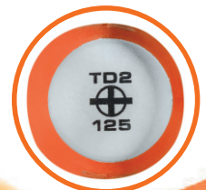
Size Markings for Easy Selection

KTK0407 Range | 1500V DC Slimline Screwdrivers