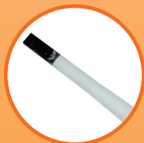
Slimline Design for Tight Spaces