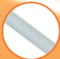
Chrome Vanadium Insulated Protective Sleeve