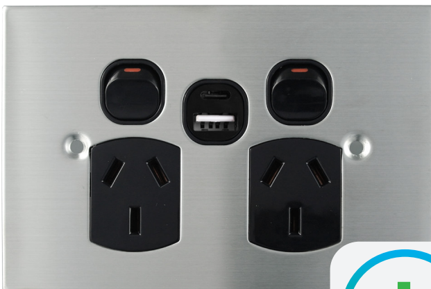
MUSB31RCB & SS-POD10X