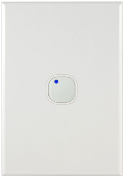
PB1-L with MTDM350