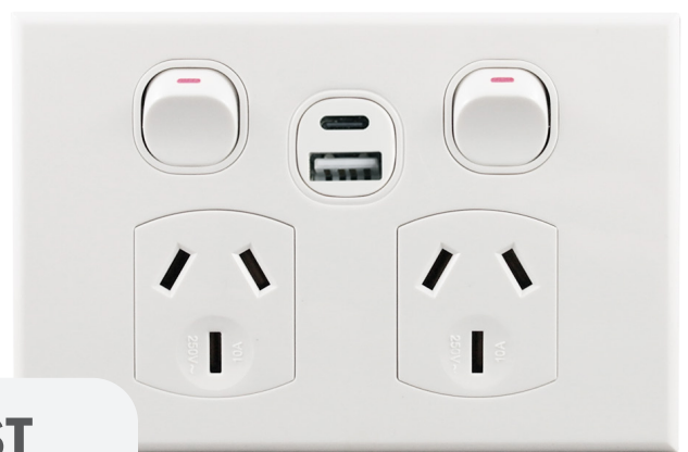
MUSB31RC & BS-POD10X