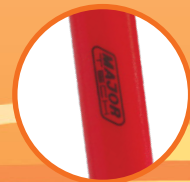
1000V Insulated Chrome vanadium steel