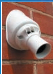
Step 4 Secure Battenholder to 530AWP.