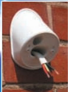
Step 1 Mount 530AWP on wall & pull through cable.