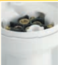
Built-in Safety Removable cover does not fall onto globe.