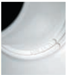
Visual Indicators Align indicators to remove cover.

Clipsal's new range of 2530 Battenholders pack more features than any other battenholders in the competition. The range consists of three different versions to suit any application, and they're all simple to install and boast the latest safety features. Simply rotate the cover 120° for easy removal, and a new built-in safety feature prevents the cover from accidentally falling onto a hot globe. Terminal slots are accessible, even after installation, and small protectors prevent accidental finger access. Finally, to ensure a clean appearance, there are no unsightly screwheads.