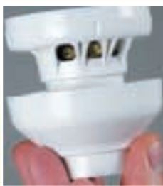
Cover Removal Cover can be completely removed after alignment.