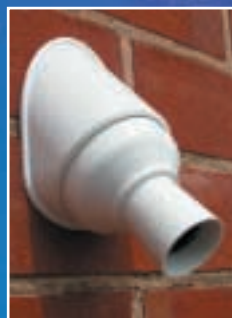
Step 5 Product is ready for light globe insertion.

NOTE: SILICON SEALANT Recommended around cable & mortar joint when mounting to ensure 'IP' Rating.